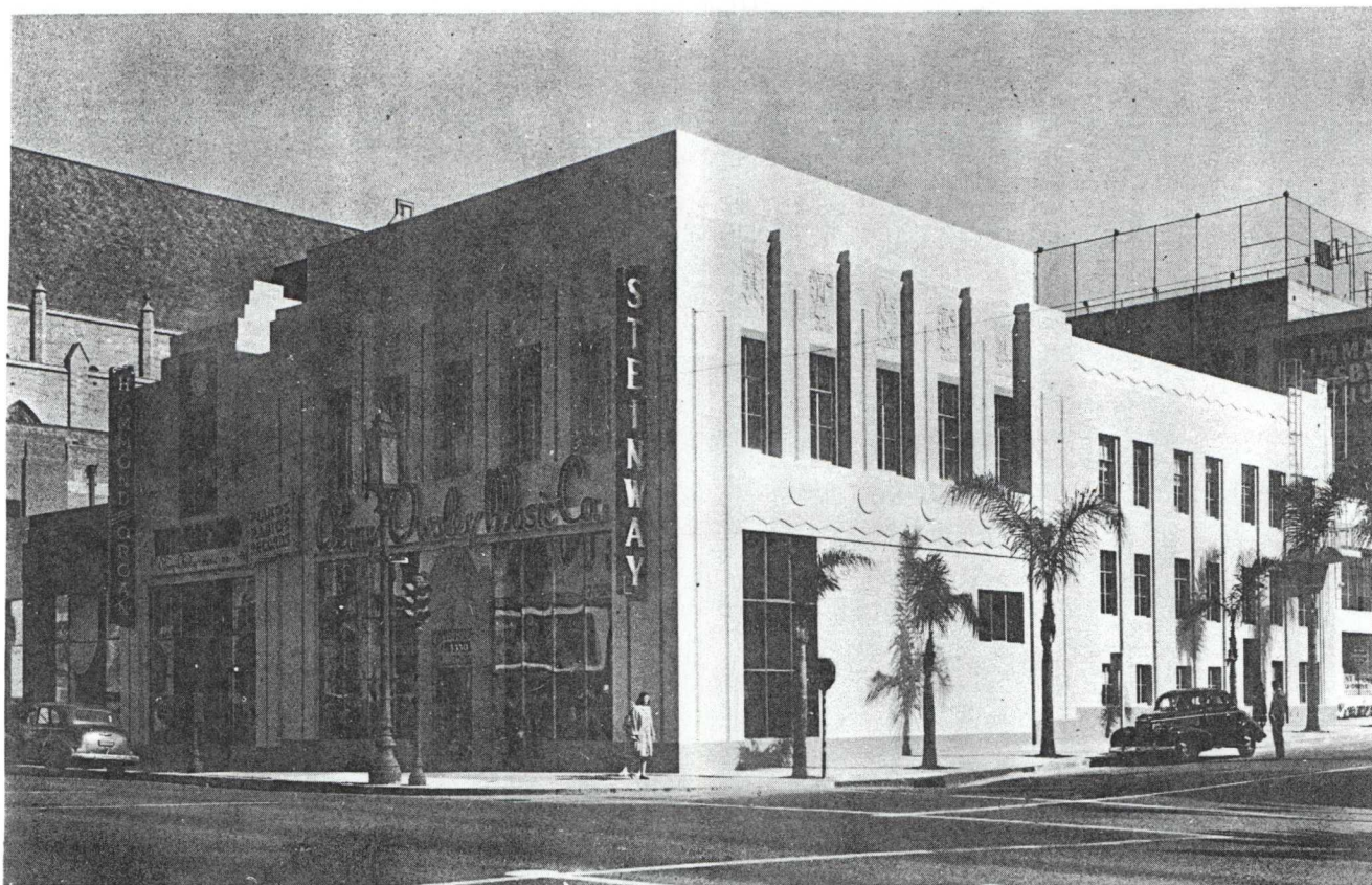
Exterior view of the Penny-Owsley Music Company